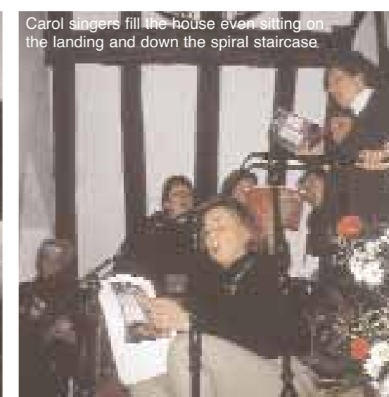
Carol singers fill the house even sitting on the landing and down the spiral staircase