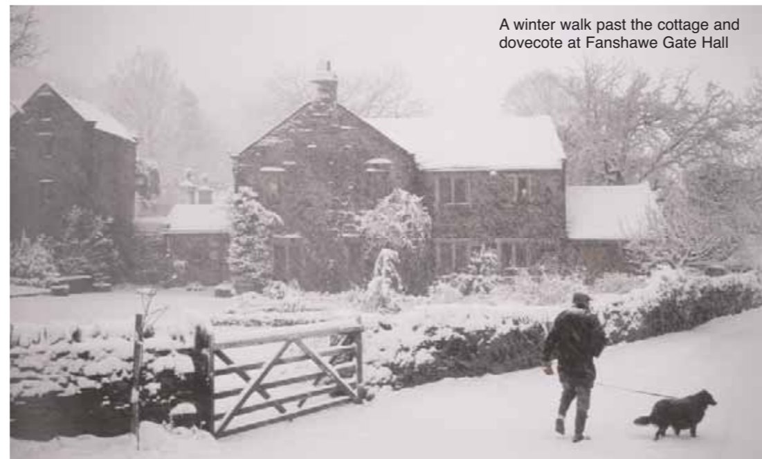
A winter walk past the cottage and dovecote at Fanshawe Gate Hall