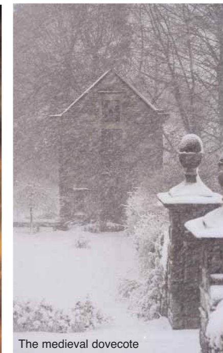
The medieval dovecote