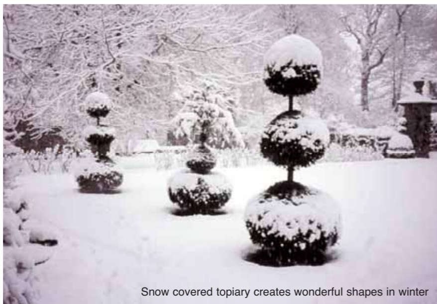
Snow covered topiary creates wonderful shapes in winter

treatment for cancer, that he would dedicate himself to whatever life she wanted to lead after her recovery. A staunch Anglican, he is a trustee of the sixteenth century trust that owns Holmesfield Church, where the family worships, and also a lay preacher. 'When times were most stressful, it was wonderful to be able to go out to a small parish in Derbyshire to take the evening service,' he says.