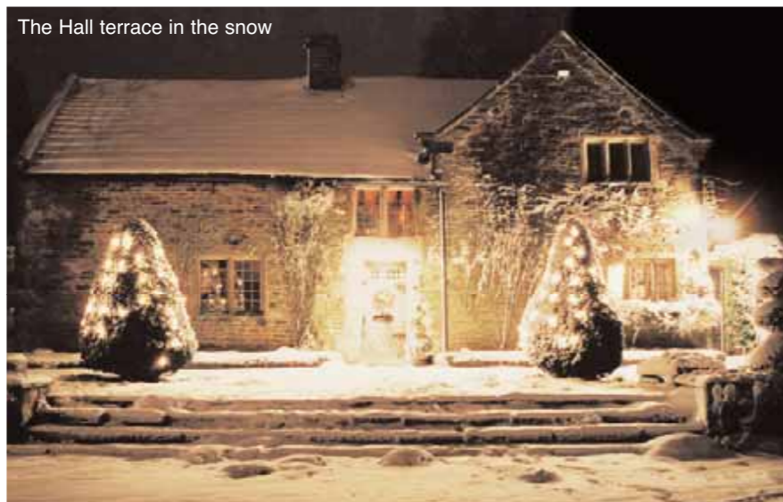
The Hall terrace in the snow