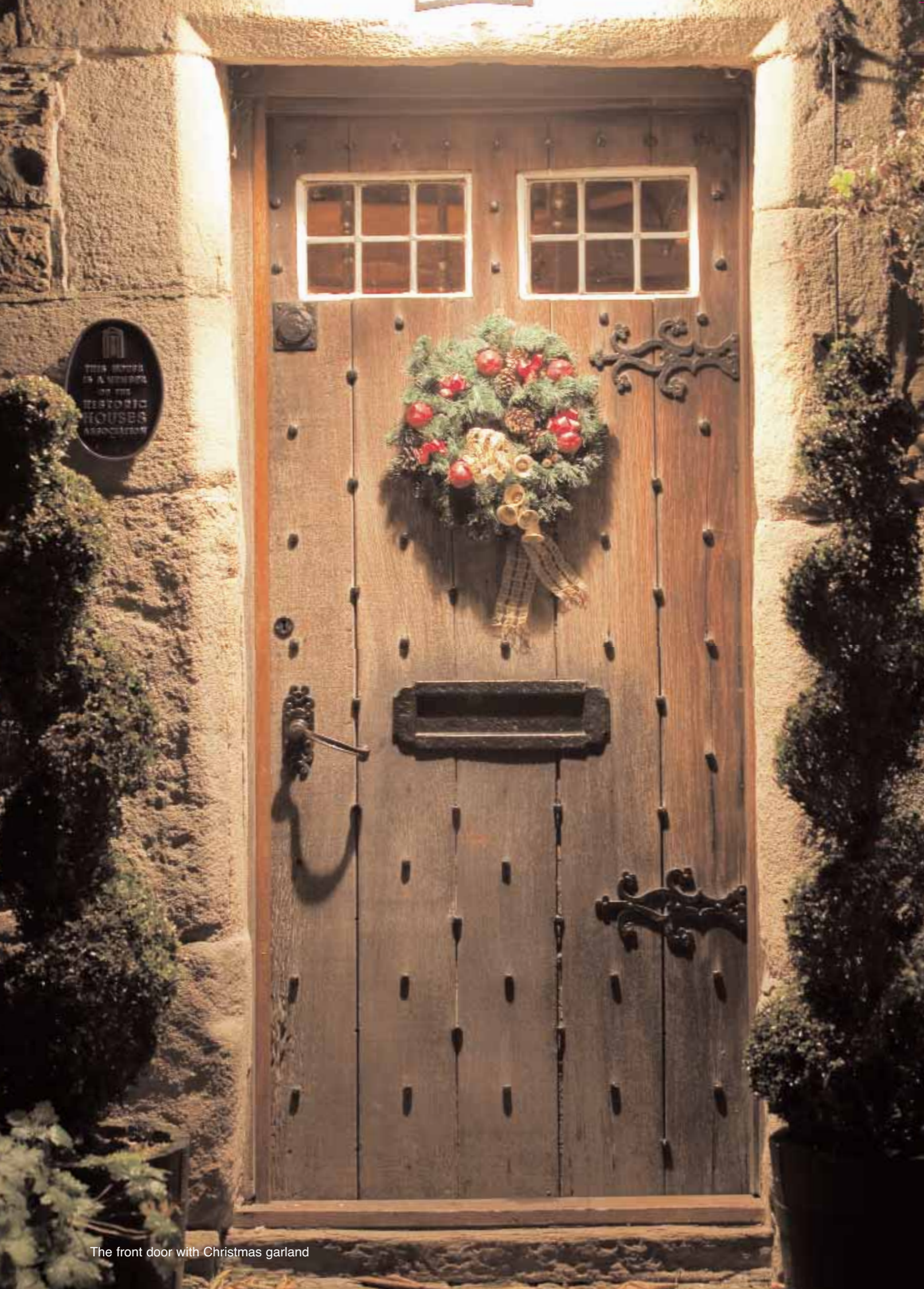
The front door with Christmas garland